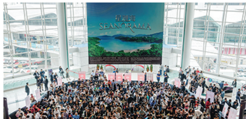
Cheung Kong Property, a Hong Kong based diversified property company, was a new position in the quarter.