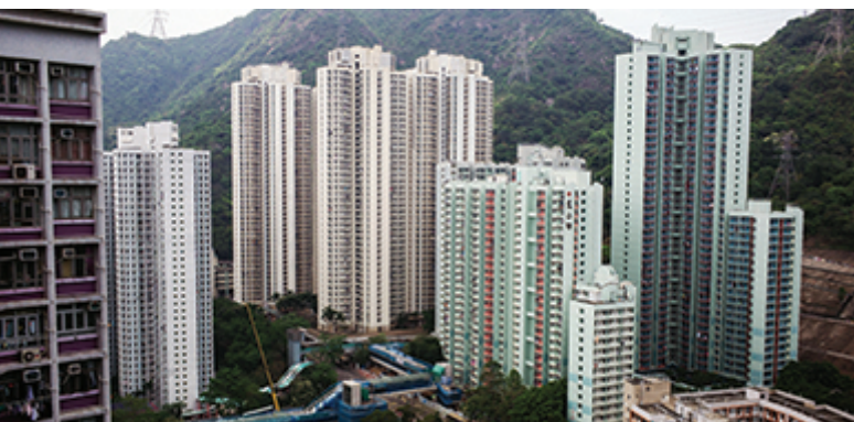
Singapore and Hong Kong were the best performing Asian real estate markets in the quarter.

Some of the biggest losers in the second quarter were IRSA, Ashford Hospitality Trust and SL Green. Argentinian IRSA was the biggest detractor, but more on external factors than company specifics. IRSA has been a strong performer over the past twelve months, but the profits were taken off the table when MSCI delayed its decision to reclassify Argentina as an emerging market. IRSA also announced an equity issue during the period, which was fairly well received by the market. Ashford Hospitality Trust is another of the worst performers this year and has continued to suffer due to a failed and irresponsible bid for Felcore, as well as a slower hospitality market in US. However, both Ashford and SL Green made only very small losses in the quarter.