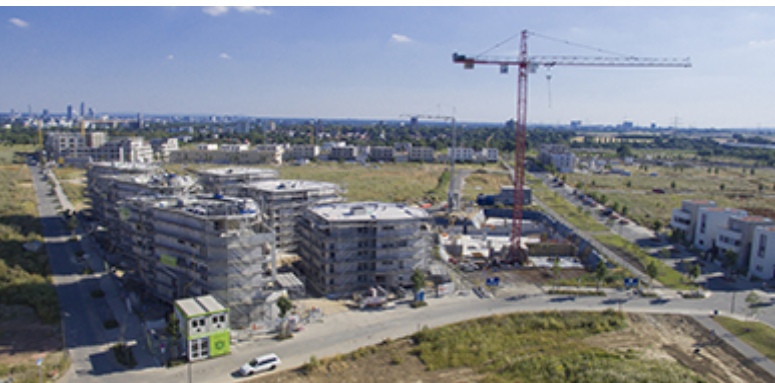
Austrian CA Immobilien was a strong contributor to the fund's performance in the quarter.

The worst contributor in the fund was Japanese Mitsui Fudosan, not due to any company specific reason, but rather to a generally weak real estate market and a weak yen. SL Green was also a detractor on the back of continued fears about the rental growth in Manhattan. The US REIT segment also progressed slowly on fears of higher and faster than expected interest rate hikes, in addition to a weak USD.