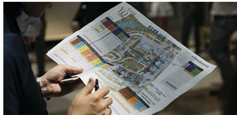
Hong Kong based Sun Hung Kai Properties is a new position in the fund.