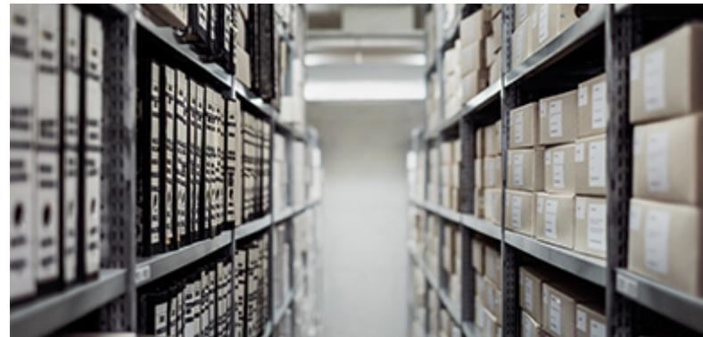
New holding: Norwegian Self Storage Group. The market is lagging in terms of storage space per capita and user behaviour.