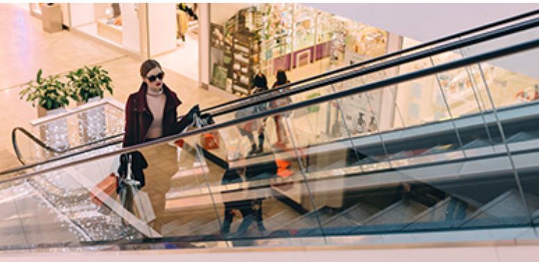
The Indian mall operator Phoenix Mills continued to perform well.

One new holding during the period was Norwegian Self Storage Group, present in Scandinavia with an untapped potential for this segment. The market is lagging in terms of storage space per capita and user behaviour. The segment is primarily driven by life changing events, but also the trend towards smaller living space and urbanisation. Self-storage generally has resilient characteristics over the business cycle. Another new holding was the Hong Kong based, but geographically diverse, Far East Consortium. The business includes investment properties, mainly hotels, and development. It is trading at a deep discount.