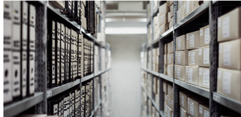
New holding: Norwegian Self Storage Group. The market is lagging in terms of storage space per capita and user behaviour.

One new holding during the period was Norwegian Self Storage Group, present in Scandinavia with an untapped potential for this segment. The market is lagging in terms of storage space per capita and user behaviour. The segment is primarily driven by life changing events, but also the trend towards smaller living space and urbanisation. Self-storage generally has resilient characteristics over the business cycle. Another new holding was the Hong Kong based, but geographically diverse, Far East Consortium. The business includes investment properties, mainly hotels, and development. It is trading at a deep discount.