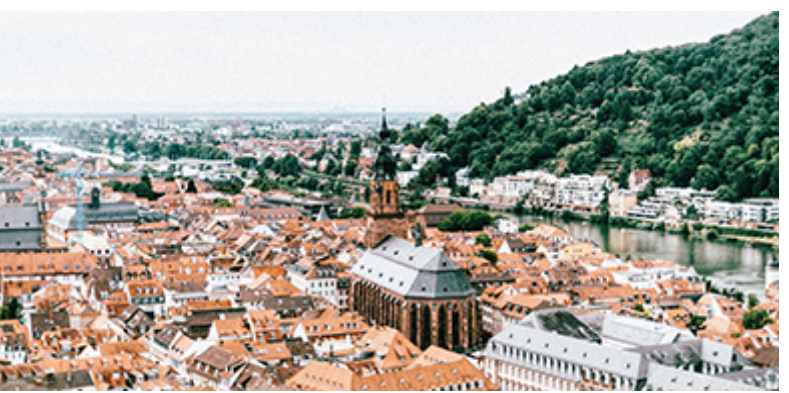
SKAGEN m2 added a new position, German Aroundtown, which is the largest listed German commercial operator.

In the first quarter SKAGEN m2 lagged its benchmark slightly. The main reason for this was the strong performance in Japan where the fund has an underweight, in addition to unfavourable currency movements with a weak EUR and strong JPY. However, SKAGEN m2 continues to